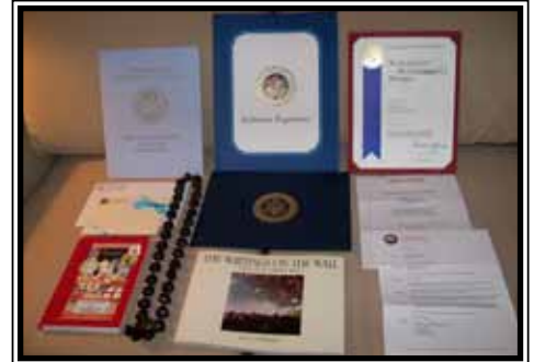
JTF Scholarship Gifts